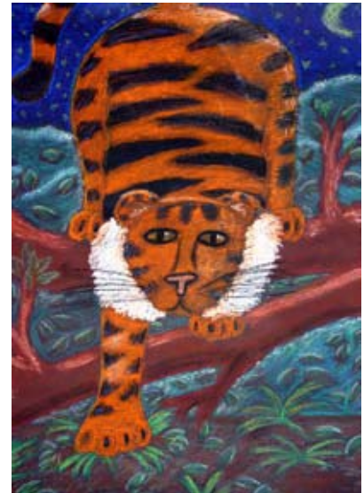
Subject: Other Living Things 'Tiger, Tiger Burning Bright' Jasmin Weir – 14 years Springwood High School

Combining drawing with other forms eg: drawing over a print, collage over drawing.